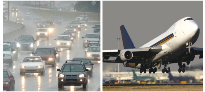
Suitable for a range of applications.

In aviation there is a trend towards increasing both safety and capacity at aerodromes which can require the installation of visibility and present sensors on runways and increasingly along taxi ways. The SWS-250 meets or exceeds all international aviation specifications for visibility measurement and present weather reporting whilst offering an affordable solution for both acquisition and cost of ownership.