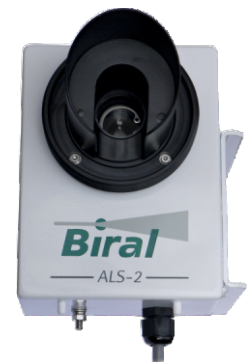
Biral's ALS-2 Ambient Light Sensor

The SWS sensor family is designed for easy installation by a single person and has an interface which simplifies system integration. The ASCII text data message is transmitted at user defined time periods or in response to a polled request. The standard data message provides MOR and EXCO along with present weather codes according to both WMO Table 4680 and METAR standards. An optional interface to the ALS-2 Ambient Light Sensor simplifies use in aviation applications where both METAR and RVR information is required. The ALS-2 Ambient Light Sensor data is appended to the standard sensor data message simplifying both installation and data processing.