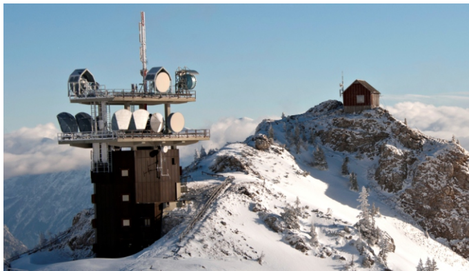
The SWS-250 is ideally suited to provide accurate measurement of raw data for forecasting models.

Whilst the models used for forecasting continue to improve there remains a need for accurate measurement of current weather conditions to provide the model's input. Improvements to forecast accuracy can also be gained by increasing the number of monitoring sites but there is always a trade-off between forecast quality and cost. The SWS-250 is ideally suited to this type of application due to the accuracy of measurement, the wide range of present weather conditions reported and the cost effective design.