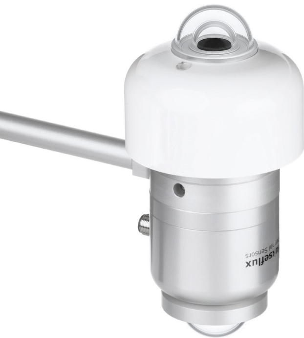
Figure 1 SRA15 series albedometer

SRA15 series Spectrally Flat Class B albedometer is an instrument that measures global and reflected solar radiation and the solar albedo, or solar reflectance. It is composed of two SR15 series Spectrally Flat Class B pyranometers and one AMF03 albedometer mounting kit. AMF03 includes one glare screen, one mounting fixture with rod, mounting hardware and tools. Each pyranometer has a thermopile sensor, the upfacing one measuring global solar radiation, the downfacing one measuring reflected solar radiation. You may choose digital SR15-D1 pyranometers with heating, analogue SR15-A1 pyranometers, offering millivolt output and heating, or SR15-D2A2 pyranometers with 4-20 mA output. SRA15 complies with the latest ISO and WMO standards. The modular design facilitates maintenance and calibration.