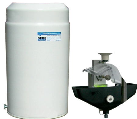
Tipping Bucket System