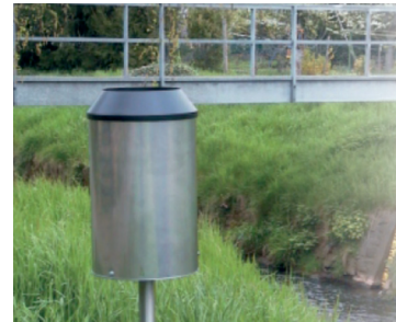
Weighing System - TRW 500 / 250