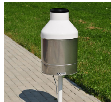
Weighing System - TRW 200 / 750