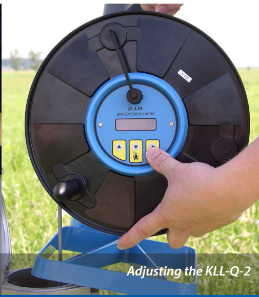
Adjusting the KLL-Q-2